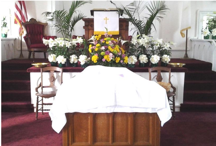
WE HAD COMMUNION