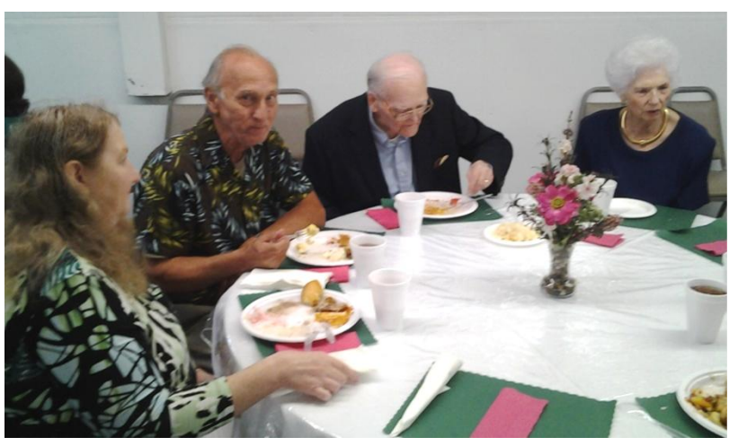
FRIENDS OF THE CHURCH